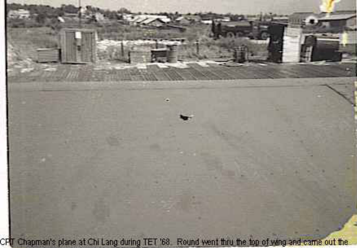
CPT Chapman's plane at Chi Lang during TET '68. Round went thru the top of wing and came out the bottom. Hit on takeoff from Vinh Long. Tower said aircraft were being fired at from just of the end of runway. Took off and make a tight turn before the tower. Discovered the hit after landing at Chi Lang.