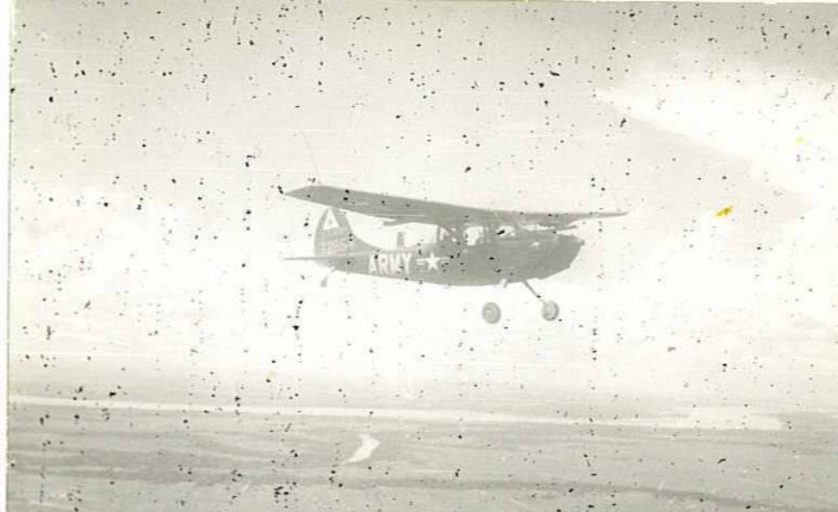
Tail # 72854, Spring '68, in support of "3rd Special Zone". Pilot unknown. May be Chapman. Note kangaroo stenciled on nose. The Aussies slipped in one night and put the kangaroo on all aircraft at Long Xuyen.